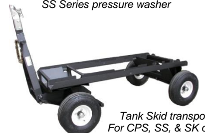
Tank Skid transporter For CPS, SS, & SK only