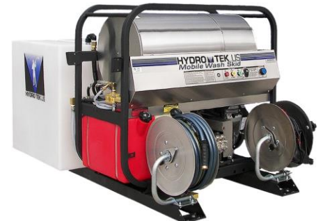
T185TW package shown with SS Series pressure washer